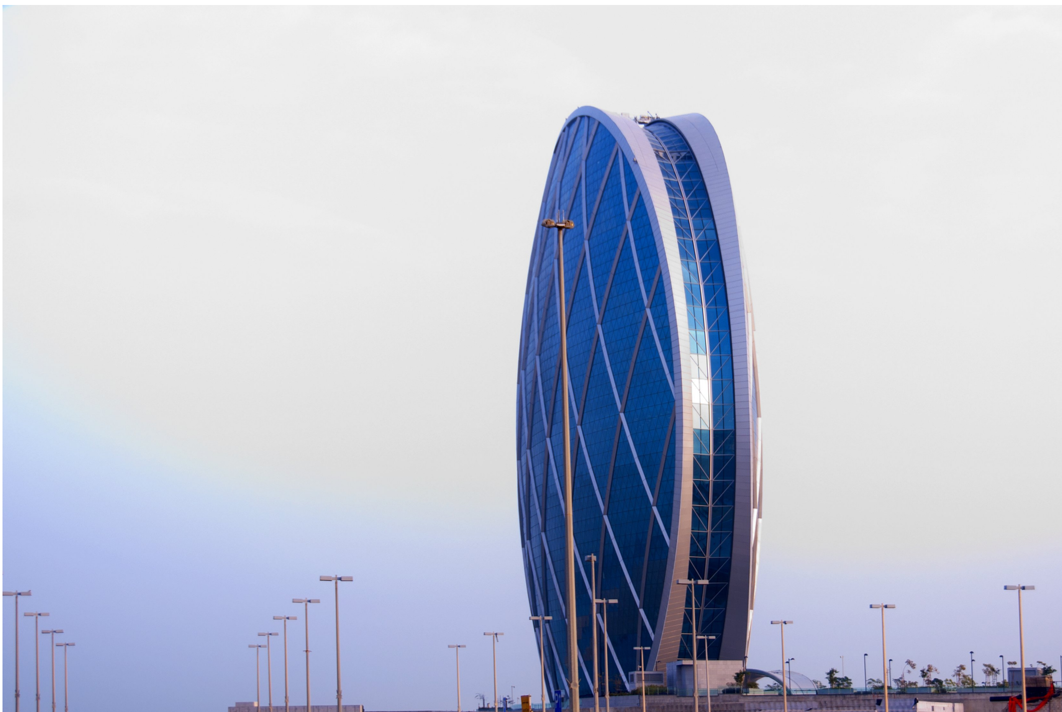
Above: Aldar headquarters building in Abu Dhabi