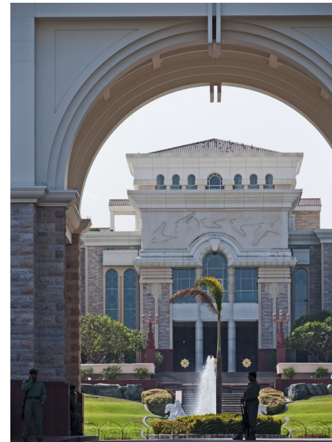
Palace of Dubai's Sheik Mohammed Bin Rashid Al Maktoum