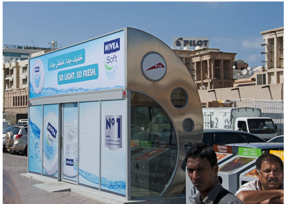
Clockwise: Dubai government buildings; air conditioned bus stop; and Rodeo Drive Factory Outlet sign