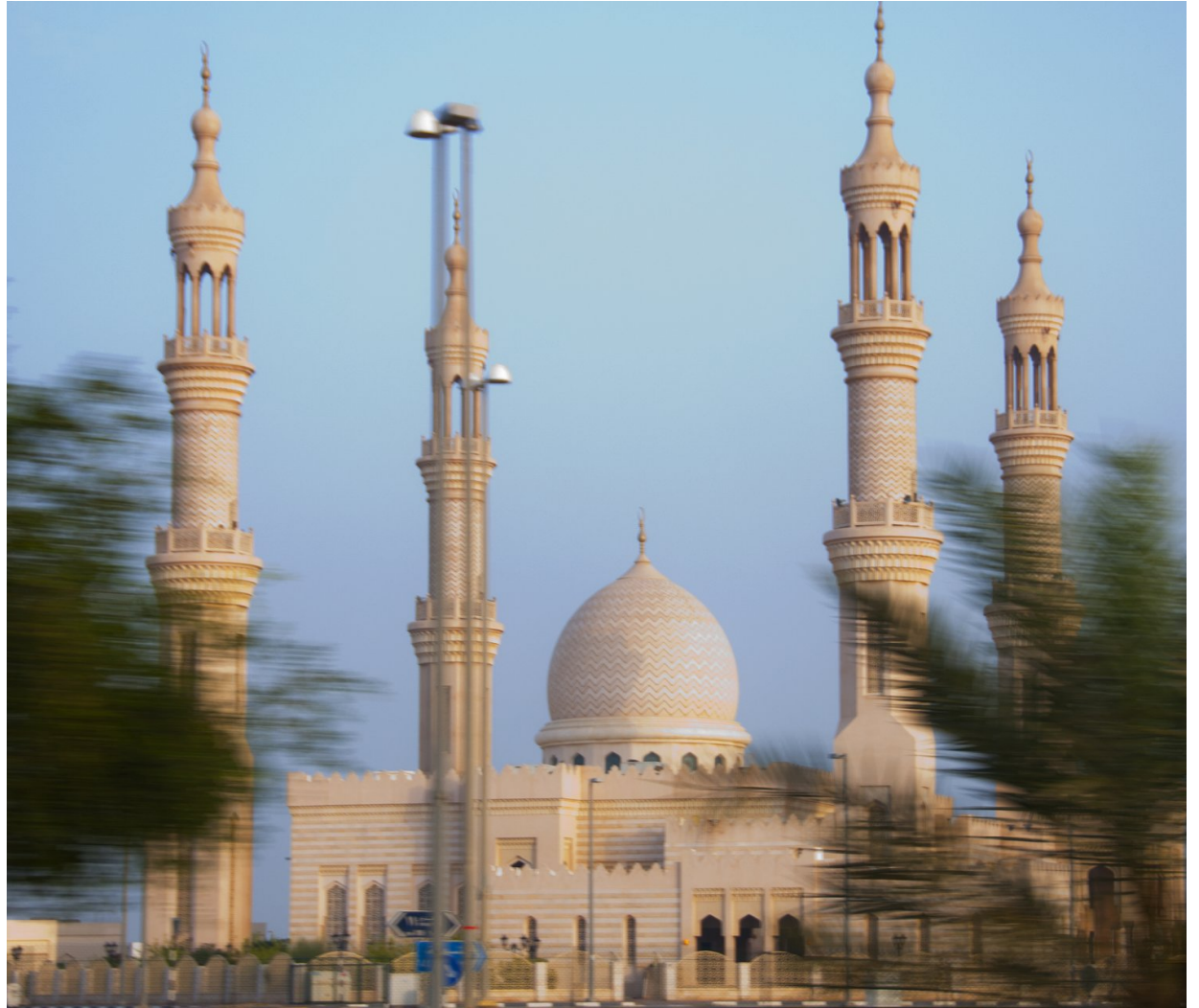
Mosque on the 90 minute drive northeast from Abu Dhabi to Dubai