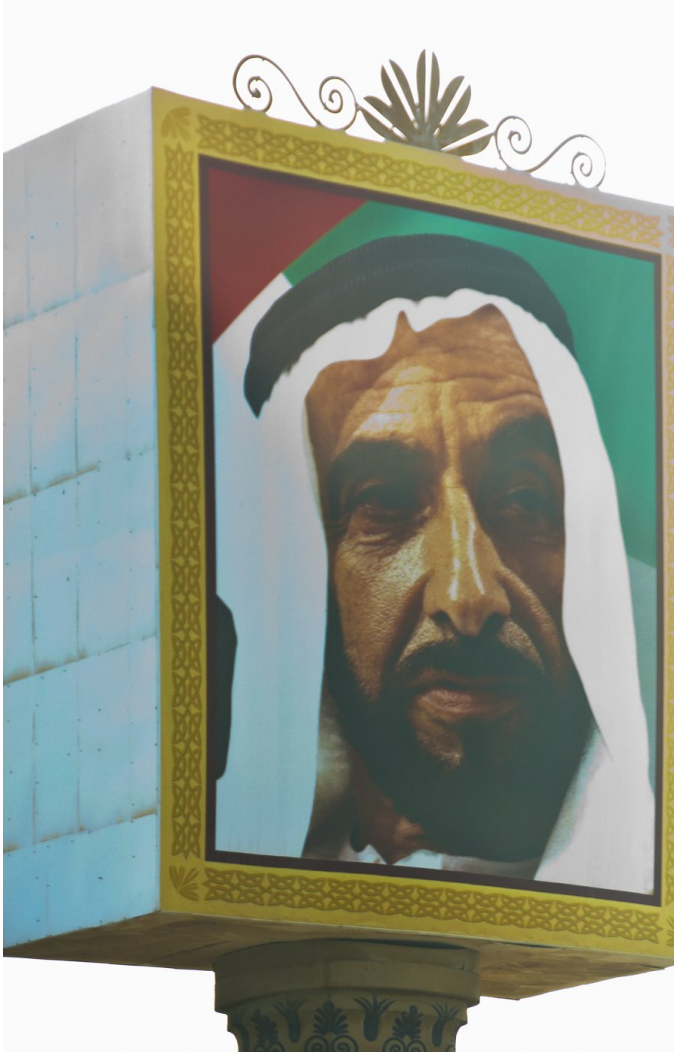
Khalifa bin Zayed, UAE President